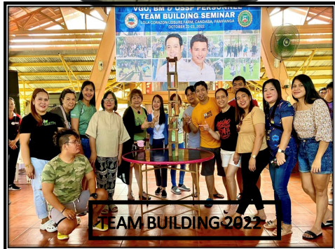
TEAM BUILDING 2022