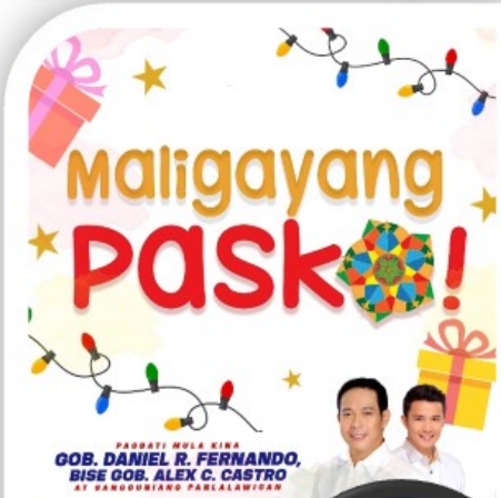
PGB Christmas Tree Lighting '22